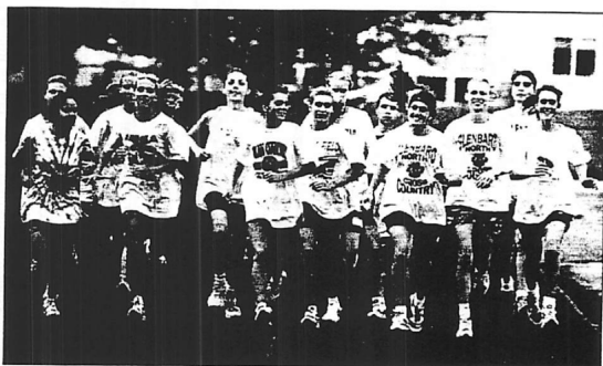
Defending champion Glenbard North is charging toward what it hopes are back-to-back titles.

In Class A, Bishop McNamara, fifth a year ago, has all seven of its runners back and a great chance for a trophy.